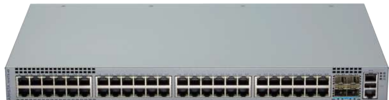
Arista 7010TX-48, 7010TX-48C, 7010TX-48-DC and 7010TX-48C-DC: 48 port 10/100/1000 and 4 port 10/25GbE Switch

The 7010TX-48, 7010TX-48C, 7010TX-48-DC and 7010TX-48C-DC all provide 48 10/100/1000Mb RJ45 ports and 4 SFP ports for 1G, 10G or 25G uplink connections with a full range of optics and cables. The Arista 7010X switches offer low latency under 3 microseconds and a packet buffer of 4MB that is fully shared and allocated dynamically to ports that are congested. Consuming just 0.3 W per gigabit, the 7010X are power efficient with choices of AC and DC power, power redundancy along with hot-swap fans supporting both forward and reverse airflow in a single system.