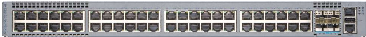
Arista 7010TX-48 and 7010TX-48C: 48 port 10/100/1000 and 4 port 10/25GbE Switch

Each of the four SFP ports supports a choice of speeds with flexible configuration between 1GbE, 10GbE, or 25GbE. All ports can operate in any supported mode without limitation, allowing easy migration from lower speeds and the flexibility for deployment over existing fiber infrastructure.