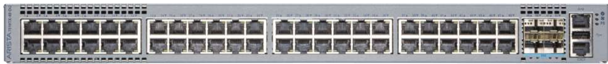
Arista 7010TX-48-DC and 7010TX-48C-DC: 48 port 10/100/1000 and 4 port 10/25GbE Switch